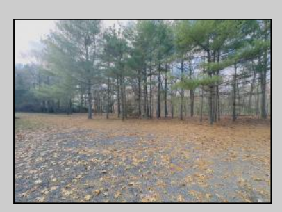
112 Duerer St Galloway Township, NJ 08205