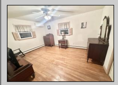
211 Vernon Ave Linwood, NJ 08221