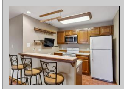
16 Meadow Ridge Smithville, NJ 08205