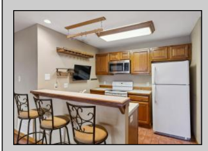
16 Meadow Ridge Smithville, NJ 08205