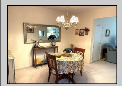
41D Michael Rd Hammonton, NJ 08037