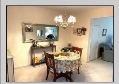
41D Michael Rd Hammonton, NJ 08037