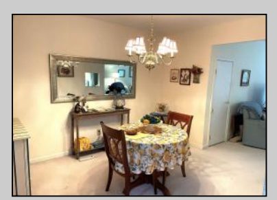
41D Michael Rd Hammonton, NJ 08037