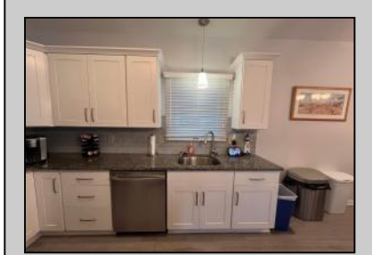
4828 West Ave. Ocean City, NJ 08226