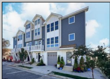
100 Monroe Margate, NJ 08402