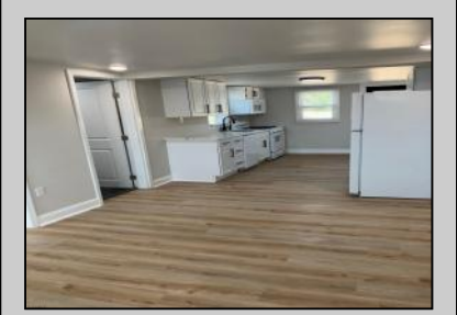
112 Pleasant Pleasantville, NJ 08232