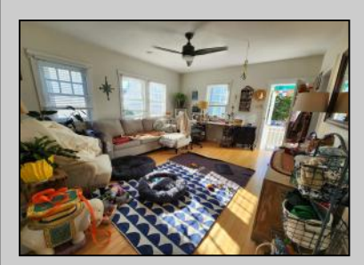
26 Morningside Ocean City, NJ 08226