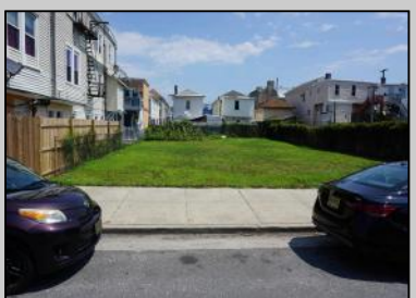
19-21 Texas Atlantic City, NJ 08401