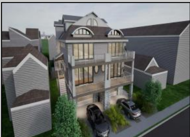
119 Madison #B Margate, NJ 08402