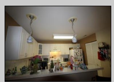
9 Pheasant Meadow Galloway Township, NJ 08205