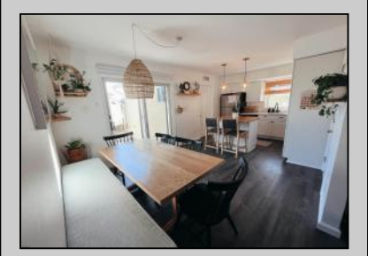
18 Rutgers Somers Point, NJ 08244