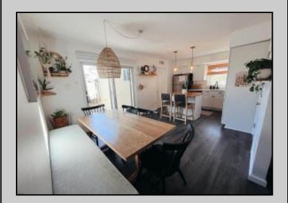
18 Rutgers Somers Point, NJ 08244