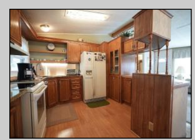
484 Pilgram Way Buena Vista Township, NJ 08310