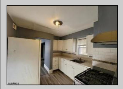
1006 Michigan Ave Atlantic City, NJ 08401