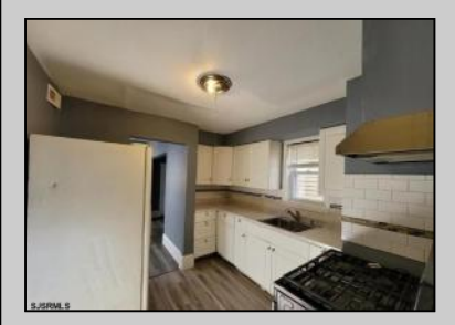
1006 Michigan Ave Atlantic City, NJ 08401