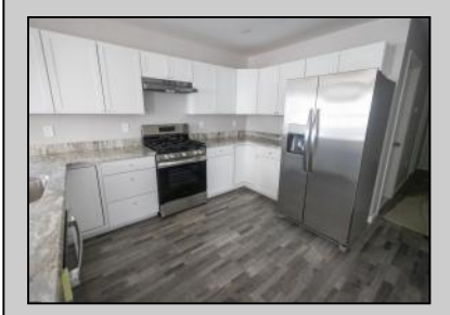
722 Lafayette Cir Pleasantville, NJ 08232