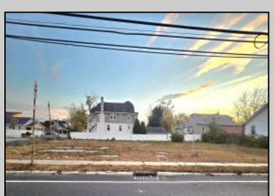
305-313 Black Horse Pleasantville, NJ 08232