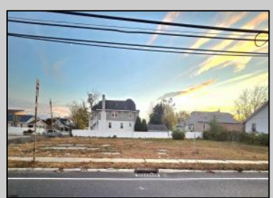
305-313 Black Horse Pleasantville, NJ 08232