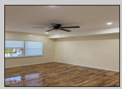
223 London Ave Egg Harbor City, NJ 08215