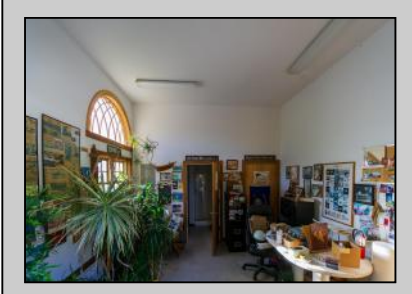
5112 Oakwood Blvd Mays Landing, NJ 08330