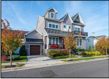
420 Delavan Ave Margate, NJ 08402