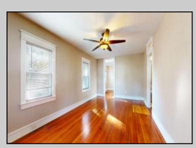
128 Pierson Avenue Somers Point, NJ 08244