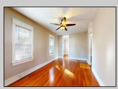
128 Pierson Avenue Somers Point, NJ 08244