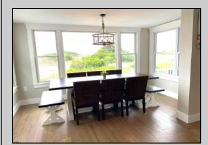
3204 Wesley Ave Ocean City, NJ 08226