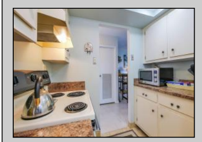
322 Boardwalk Ocean City, NJ 08226