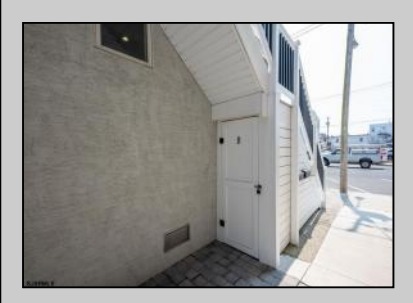
708 West Ave Ocean City, NJ 08226