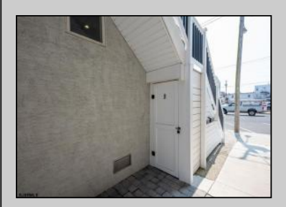
708 West Ave Ocean City, NJ 08226