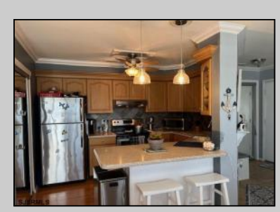
401 Harbour Cv Somers Point, NJ 08244