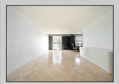
101 Plaza Place Atlantic City, NJ 08401