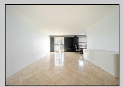
101 Plaza Place Atlantic City, NJ 08401