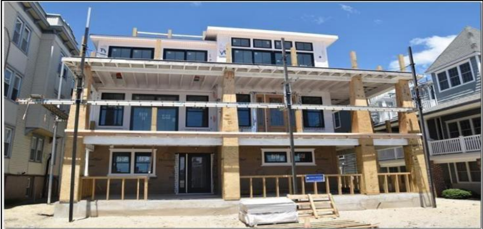
1116 OCEAN AVENUE