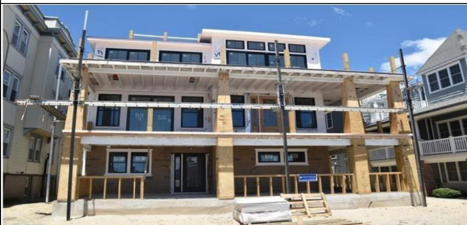
1116 OCEAN AVENUE