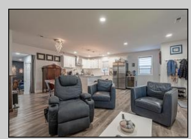
306 Sycamore Ave Egg Harbor Township, NJ 08234