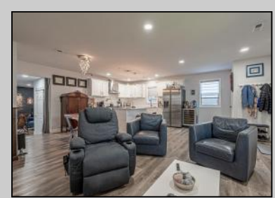
306 Sycamore Ave Egg Harbor Township, NJ 08234