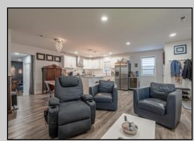
306 Sycamore Ave Egg Harbor Township, NJ 08234