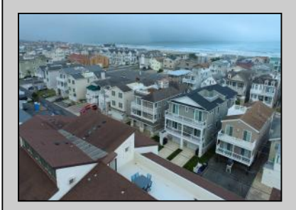
301 41st St Apt 37 Ocean City, NJ 08226