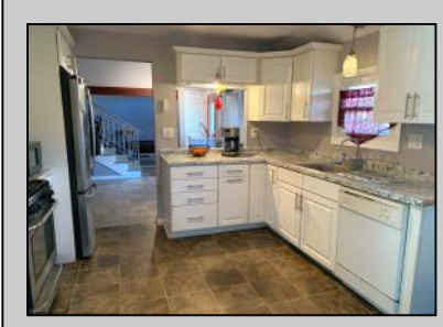
698 Maryland Somers Point, NJ 08244