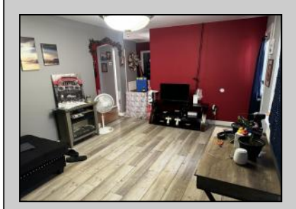
6304 Nelson Hamilton Township, NJ 08330