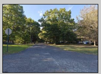
203 Haws Ct Galloway Township, NJ 08205