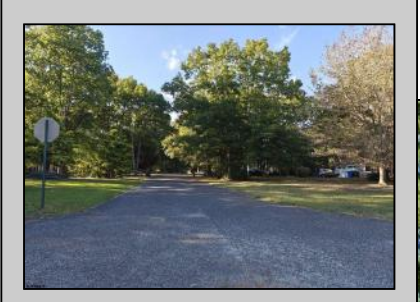
203 Haws Ct Galloway Township, NJ 08205