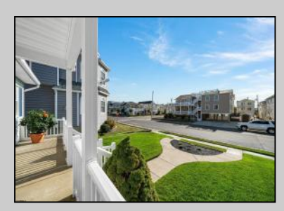
2904 Haven Ave Ocean City, NJ 08226