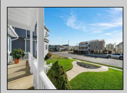
2904 Haven Ave Ocean City, NJ 08226