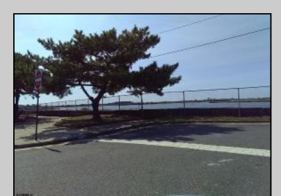
2442 Sunset Ave Atlantic City, NJ 08401