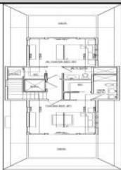
1/2 STORY PLAN VIEW