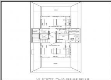
1/2 STORY PLAN