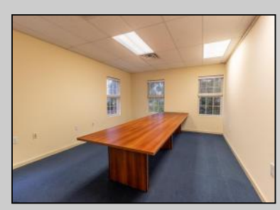
337 Jimmie Leeds Galloway Township, NJ 08205